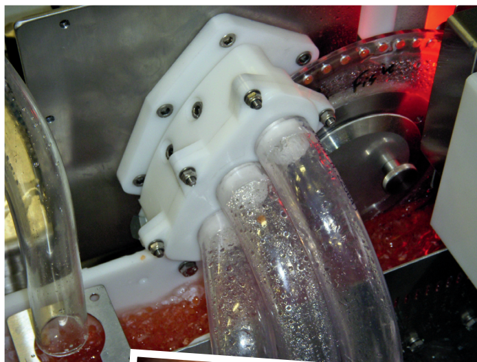
An AGM egg sorter in action

Maskon will attend the AquacultureUK 2010 exhibition in May, stand 7 in the Alfresco Marquee.